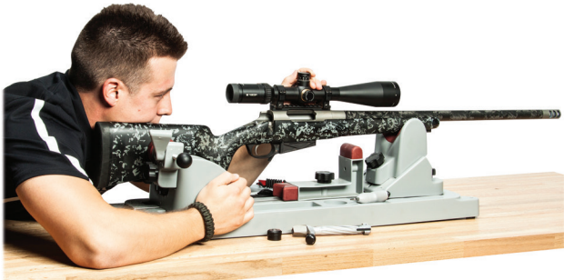
Visually bore-sighting a rifle.