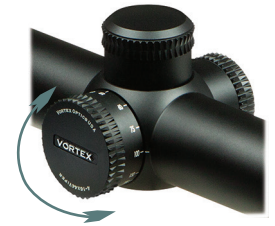
Adjust the side focus knob

Parallax is a phenomenon that results when the target image does not quite fall on the same optical plane as the reticle within the scope. When the shooter's eye is not precisely centered in the eyepiece, there can be apparent movement of the target in relation to the reticle, which can cause a small shift in the point of aim. Parallax error is most problematic for precision shooters using high magnification.