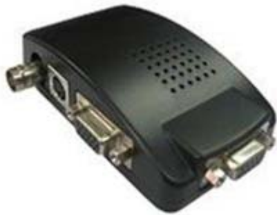
BNC to VGA Converter

Other Possible Converters that could be used to convert the analog video output of the Renegade 320 to an input format that would work with either your recording equipment or monitor (these are available either on-line or an video equipment dealers)