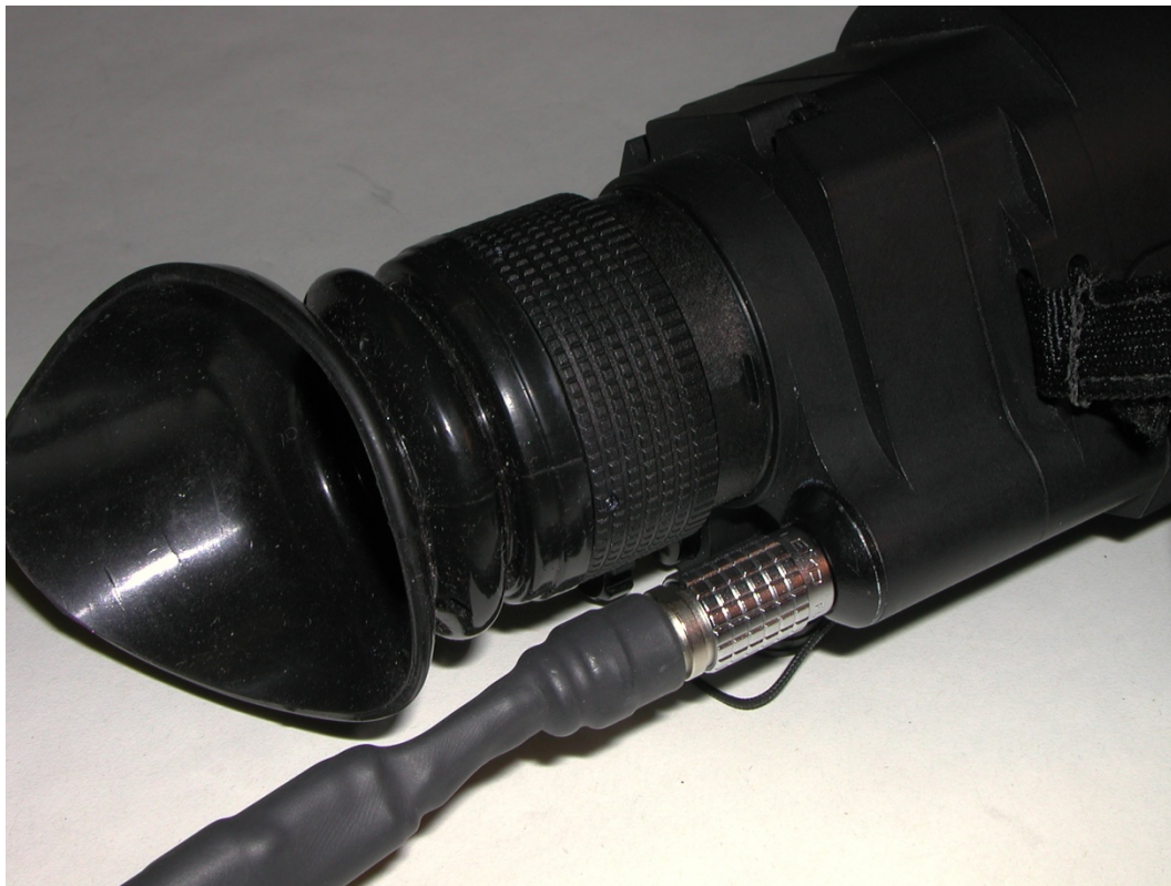
Renegade 320 Interface Cable Connection