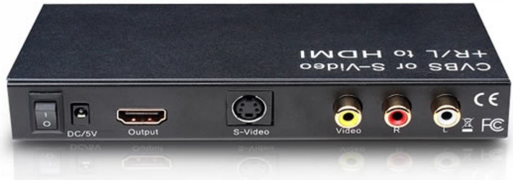
Analog Video to HDMI Converter