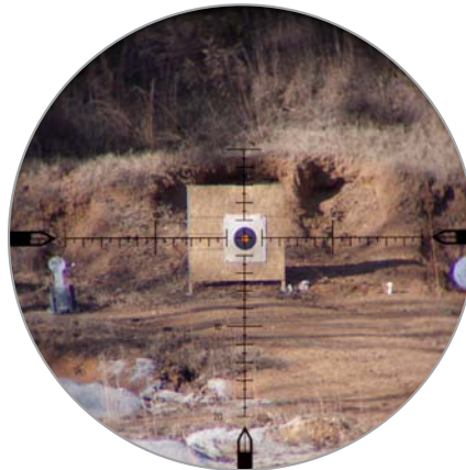
Actual field photo of MOAR™ in Nightforce 5.5-22 x 50 NXS at 22 power.

Image above shows the MOAR™ reticle used in 3.5-15X NXS riflescopes. It has 30 MOA below the centerline. MOAR™ reticles in 5.5-22X and 8-32X NXS models have 20 MOA below the centerline.