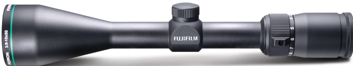
THE ACCURION 3.5-10 X 50

Introducing the new lightweight and high performance ACCURION™ riflescope from FUJIFILM. The ACCURION represents an outstanding combination of advanced optical design and high-tech manufacturing. Beautifully crafted and engineered to perform seamlessly in the roughest conditions, if you want performance and expect results, you want the ACCURION from FUJIFILM.