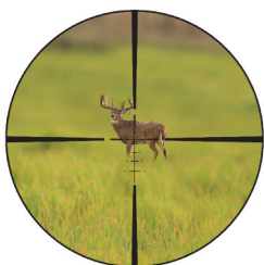
Reticle on Low Power

All Veracity riflescopes utilize a Front Focal Plane system. Front Focal Plane systems (also called First Focal Plane systems) place the reticle in front of the erector assembly or zoom mechanism. This allows the reticle to change size as magnification is adjusted. In FFP systems, when magnification is increased, the reticle size grows; as magnification is lowered, the reticle size shrinks. Because the reticle is changing with magnification, the measurements of the reticle are always correct and are proportional to the target, no matter what power setting you may be on. This also means that the trajectory compensation technology is correct in Veracity riflescopes at any magnification.