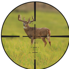
Reticle on High Power