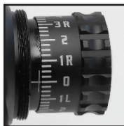
Proper Windage Zero

NOTE: Windage adjustments are made with a multi-direction adjustment knob. Zero is set with an indexing mark to allow for left and right adjustments. Failure to zero at the index mark may result in limited windage adjustment.